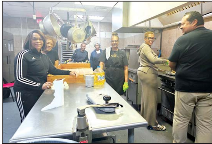
Quarterly Breakfast – Oct-Dec Months Meal Prep Crew