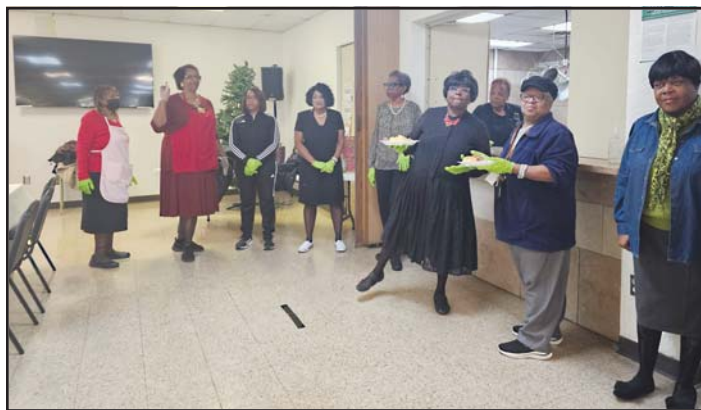
Quarterly Breakfast – Oct-Dec Serving Crew