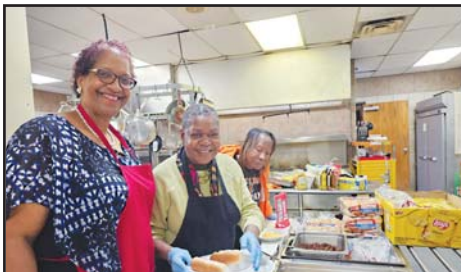
December PF serving during Refreshing Hour

(“Parish Fellowship” continued from page 5)