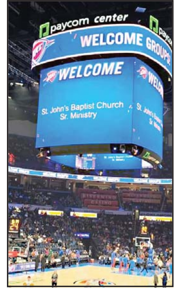
Paycom Sign: St John Seasoned Saints Recognized