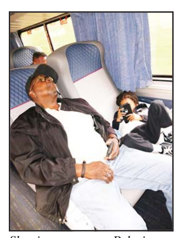
Sleeping passenger: Relaxing on train