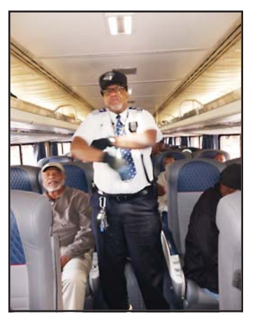
Conductor in aisle: All Aboard!

Our mission is to encourage all Seasoned Saints to stay actively engaged in corporal worship services, community outreach, and all St. John Kingdom Building endeavors.